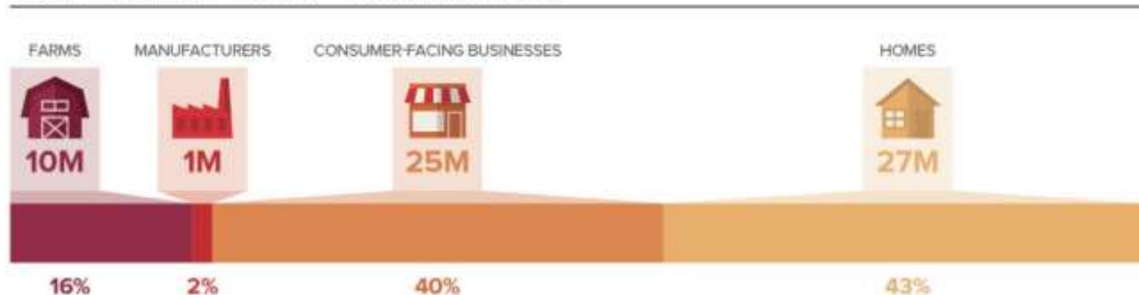
FOOD WASTED BY WEIGHT — 63 MILLION TONS